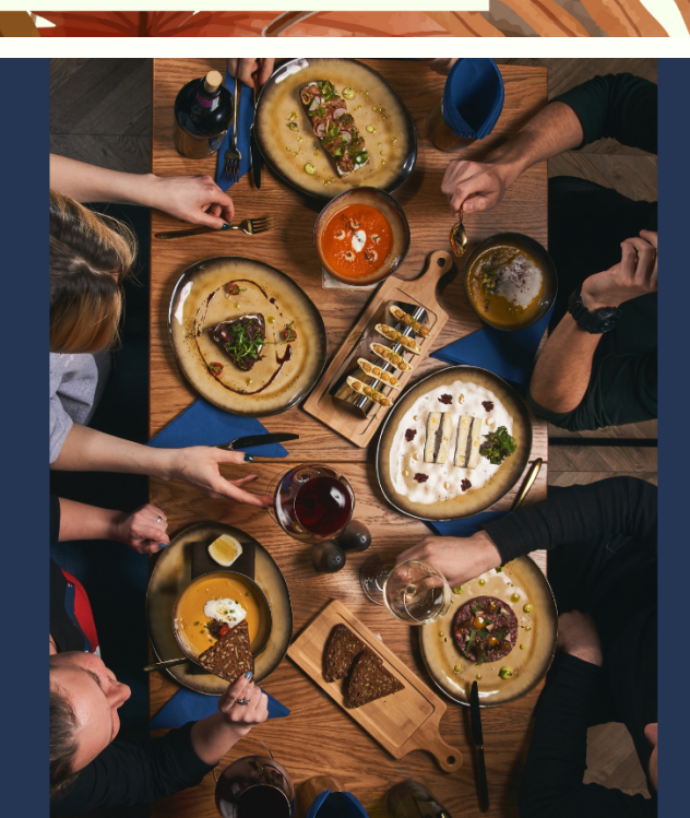
Table Fellowship, Bible Study, Discipleship... Exploring how to truly be the Body of Christ!